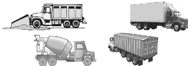
Single-Unit (3 or More Axles)